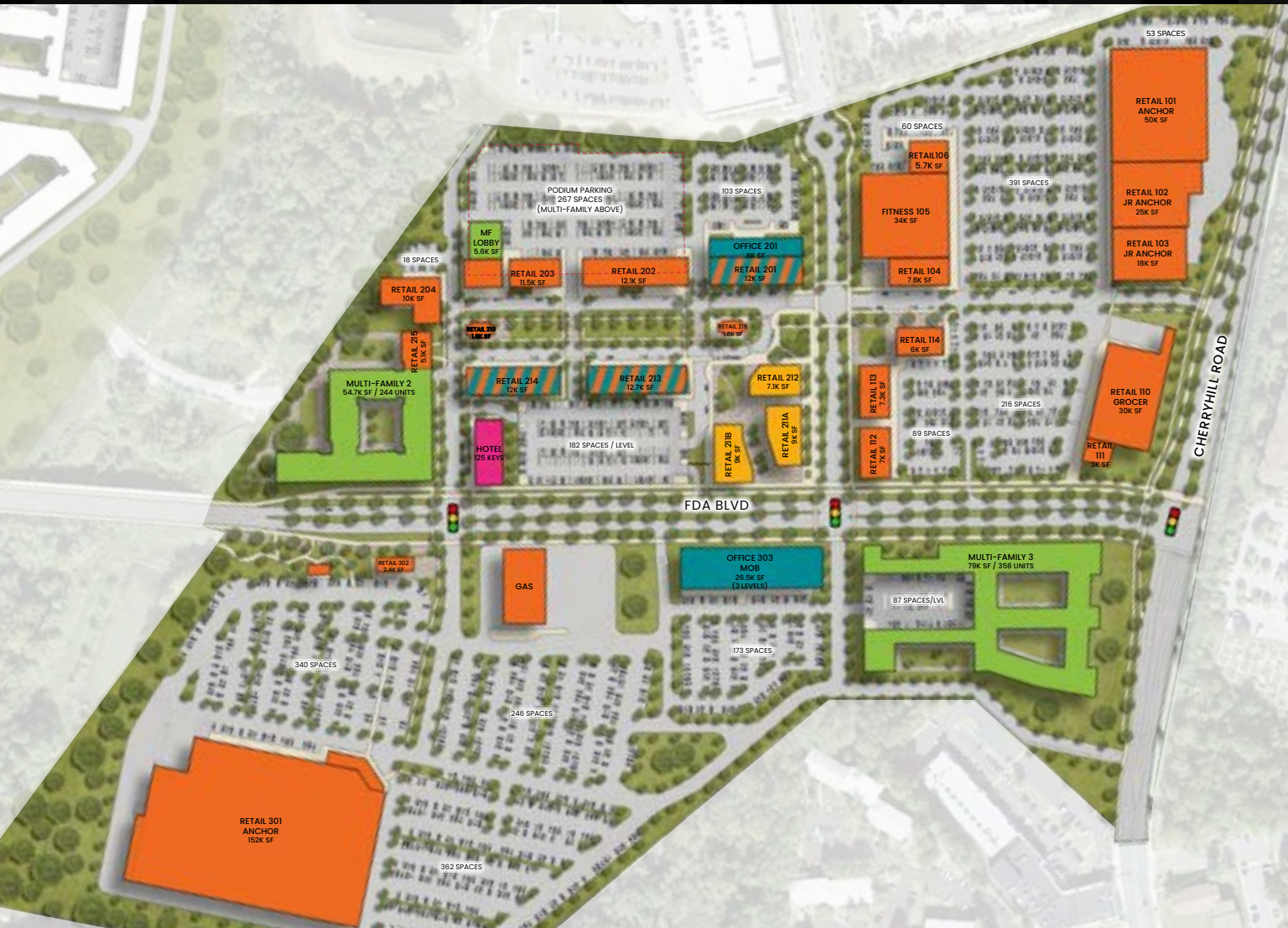
TOWN CENTER DETAILS