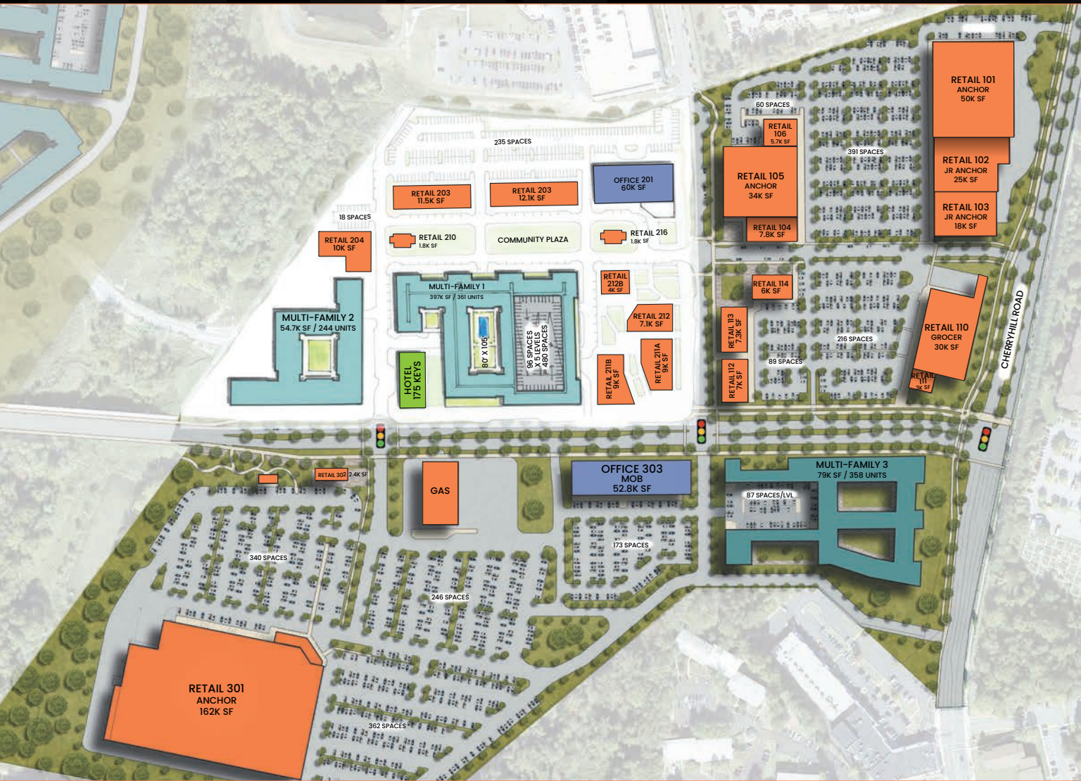
TOWN CENTER DETAILS