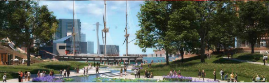
FUTURE DEVELOPMENT: PARK AT FREEDOM'S PORT