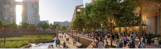
FUTURE DEVELOPMENT: WATERFRONT PROMENADE